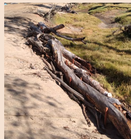
Example of using logs on riverbanks – Pumphreys Bridge

Read the full article here: https://peel-harvey.org.au/cyclone-narelle-in-the-works/