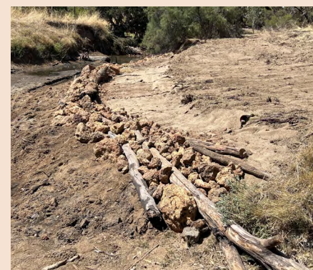
Example of using rocks on riverbanks – Williams

This project is supported by funding from the Western Australian Government's State NRM Program. This project is also supported by Newmont (Boddington)