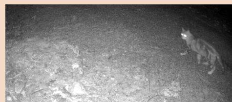
Photos: Numbat, Chuditch & Feral cat