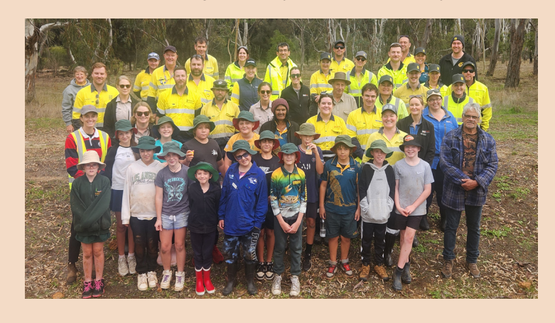
The project "Regeneration of Camballing Reserve and Surrounds" is funded by the Western Australian Government's State Natural Resource Management Program

significance, and the rehabilitation of those areas to remove invasive plants and revegetate with species that belong there will help to acknowledge and pay respect to Country.