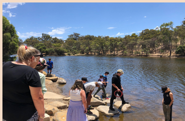
Hotham River Nature Walk