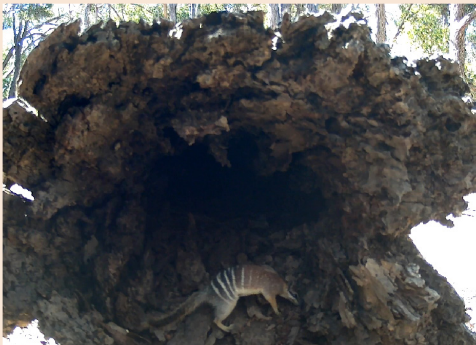
The numbat capture on a monitoring camera near Boddington.

COVID -19 We value the health and safety of our whole community and PHCC is now accepting visitors on an appointment basis only. Please contact us to make a booking via phone on 6369 8801 or 0455 166 780 or via email.