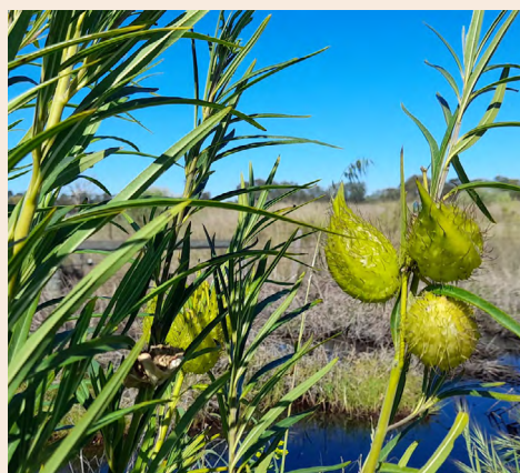
Narrow leaf cotton bush (Gomphocarpus fruticosus)

Early identification and control is essential. For more information about control methods see https://www.agric.wa.gov.au/declared-plants/narrow-leaf-cotton-bush-declared-pest