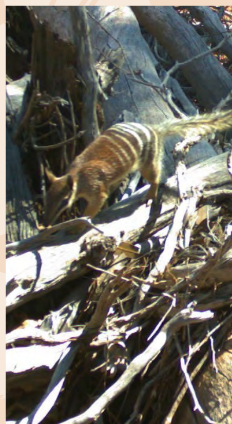
Numbat captured on South32 monitoring cameras.

If you do see a numbat or any other threatened species please call in the Hotham-Williams office on 63698801 and we will help you to fill out a DBCA fauna report form.