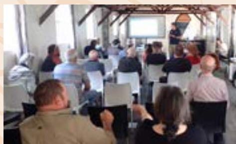
Bushland Management Workshop in the Dryandra Hall

Protecting on farm habitat is important for threatened species and we were able to hold this workshop through PHCC's Numbat Neighbourhood Project.