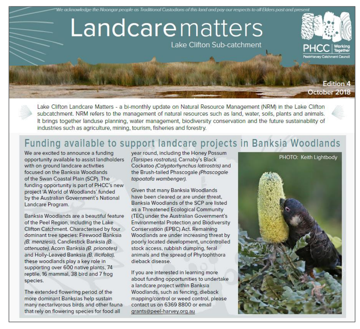
Figure 6: Article in Edition 4 of Landcare Matters promoting funding available to landholders

Although there were no applicants in this first round of funding, the second round of funding will be announced in August 2019 and eligible landholders will be personally contacted and encouraged to apply for funding (those who have had a Land for Wildlife Site Assessment on their property, or undertake to have a Site Assessment conducted as part of the grants process).