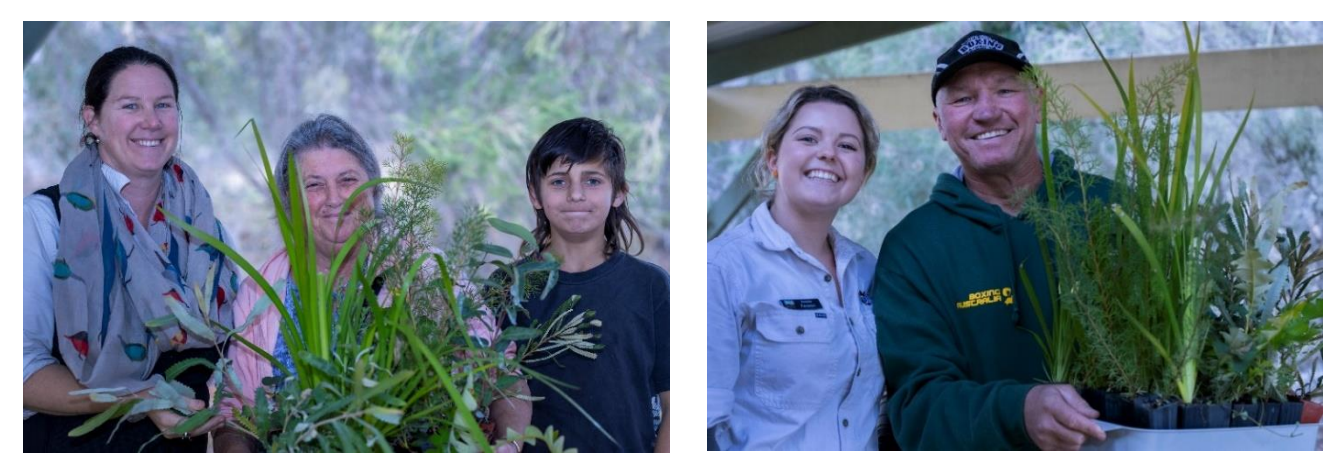
Figure 1: Residents receiving seedlings at the 2019 Lake Clifton Seedling Giveaway

Several community groups and organisations were also in attendance at the event and provided attendees with information on additional topics such as controlling feral animals, identifying weeds on your property and local wildlife. This event provides an opportunity for NRM officers to speak with landholders one-on-one and for landholders to provide feedback on topics of interest for future events.