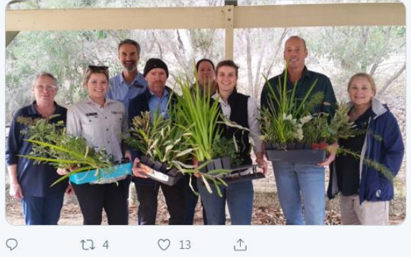
Jordon Garbellini @JordonGarbellin · Oct 17, 2018

Another #BlueDiamond in the Lake Clifton Catchment! These Lake Clifton locals are passionate about their patch and proud to display their new #LandforWildlife sign to show their dedication @PeelHarveyCC @CitvofMandurah @WAParksWildlife