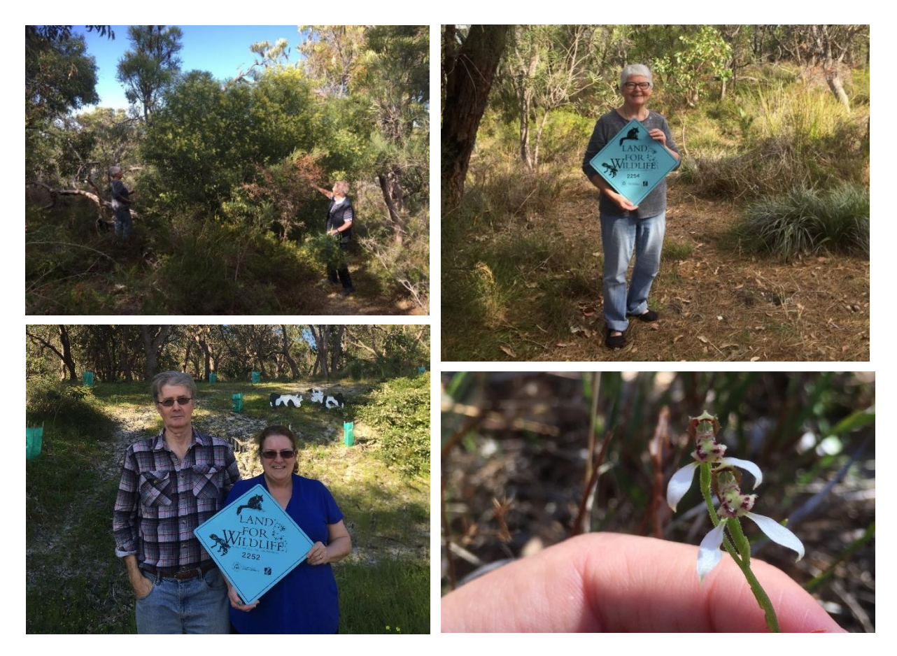
Figure 5: Land for Wildlife provides a great opportunity for landowners to learn more about their patch of the catchment

A summary of Lake Clifton Catchment landholders involved in the Land for Wildlife program are included in Attachment 2. This information is confidential and not for distribution.