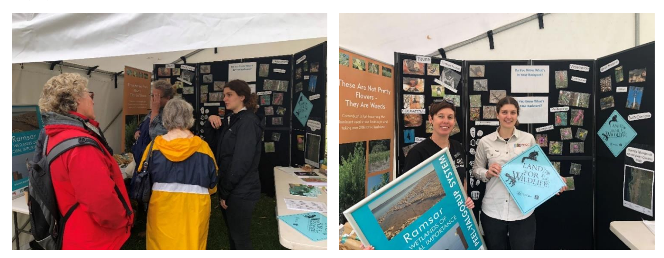
Figure 4: The Yalgorup Bioblitz provided a great opportunity to promote Land for Wildlife to the local community

PHCC contributed to the City of Mandurah's Yalgorup BioBlitz through the addition of a combined stall focusing on the Shorebirds of the Ramsar listed Yalgorup Wetlands and Lake Clifton Wildlife, manned by the Land Conservation officer and Wetlands and People officer. The event did not generate expected visitor numbers (poor weather was thought to have been a deterrent) and it was not successful in generating further interest in stewardship activities such as Land for Wildlife in the catchment. This event did however provide an opportunity for the Land Conservation Officer to pull together materials for an interactive display that will be useful for future events.