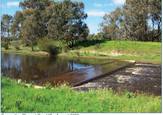
Serpentine River at Dog Hill – August 2001

To the Darling Scarp's east the catchment remains relatively undisturbed. West of the scarp the land has been cleared, mostly for agriculture (e.g. stock grazing) and lifestyle blocks. More intensive land uses such as sheep feedlots, poultry farms and piggeries are also present.