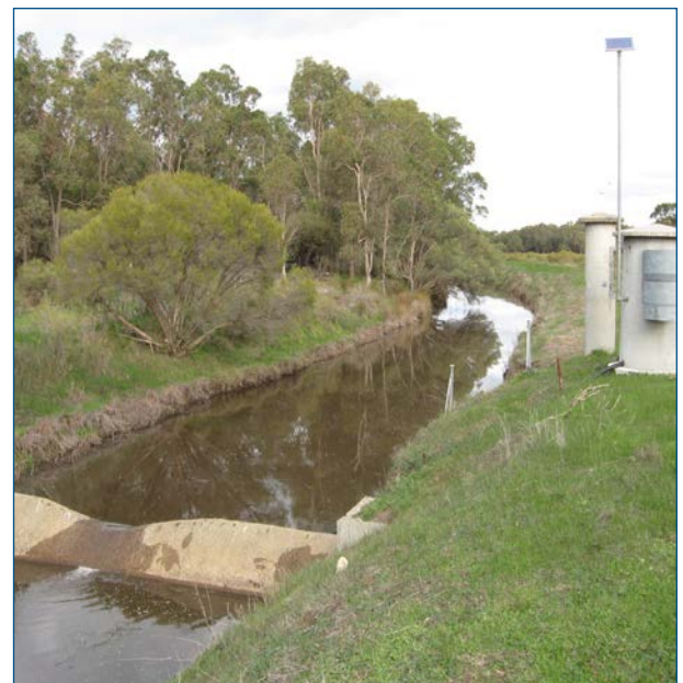
Coolup South Main Drain 613027 – May 2005