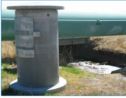
Samson North Drain gauging station at Somers Road - March 2005

is located adjacent to Somers Road (613014). The drain has been monitored for nutrients since 1990 while flow was measured from 1978 to 1999 and again between 2005 and early 2008. Samson North Drain flows year round.