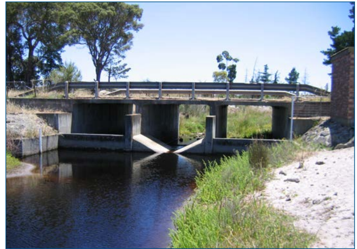
Meredith Drain, Johnston Road – December 2006

Two thirds of the catchment has been cleared, mostly for agriculture such as stock grazing and plantations. There is also a piggery present.