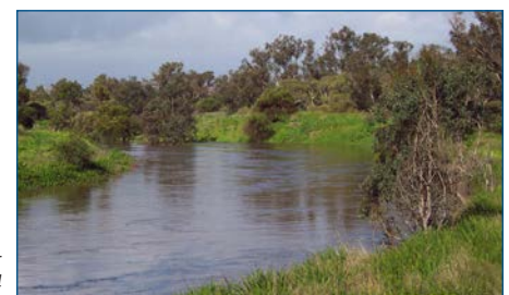
Harvey River – July 2004

To the east of the Darling Scarp the catchment remains relatively undisturbed. West of the scarp, the land has been cleared, mostly for agriculture such as stock grazing, as well as more intensive land uses such as piggeries and turf farms.