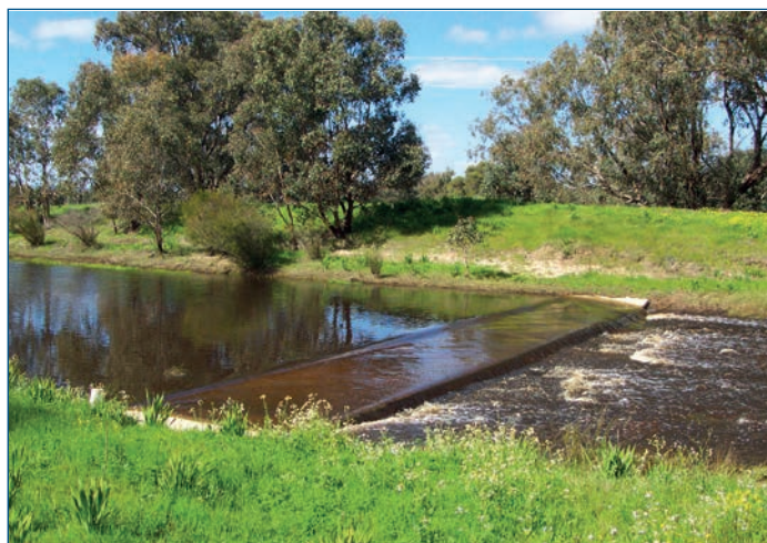
Serpentine River at Dog Hill – August 2001