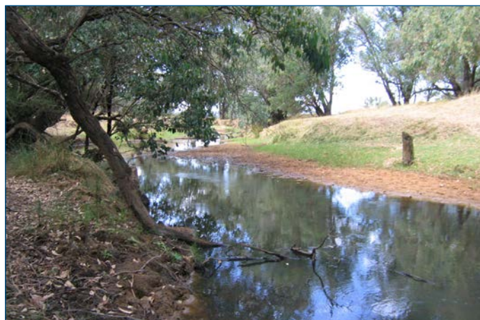
Upstream view of the South Dandalup River at Patterson Road – February 2008