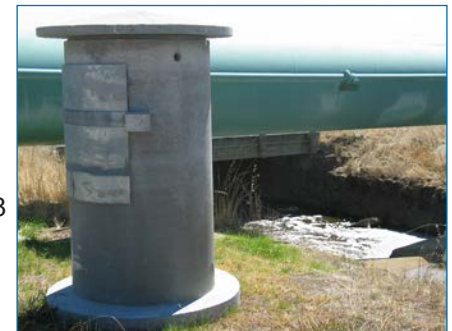
Samson North Drain gauging station at Somers Road - March 2005

The catchment's monitoring site on Samson North Drain is located adjacent to Somers Road (613014). The drain has been monitored for nutrients since 1990 while flow was measured from 1978 to 1999 and again between 2005 and early 2008. Samson North Drain flows year round.