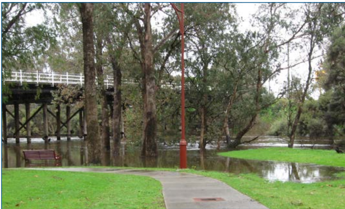
Flooding at Pinjarra, highest flow for the year – August 2009

The sampling site on the Murray River at Pinjarra Road (614065) is one of three long-term monitoring sites within the Peel-Harvey catchment. Nutrients have been monitored at the site since 1983 (except 1994 and 1995) and flow since 1992. The Murray River flows year-round with river height varying by more than 4 m in some years (1998 and 2009).