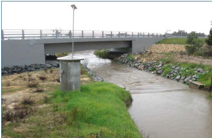
Mayfield Drain - July 2010

The catchment's soils are mostly poorly drained flats and sandy soils containing either ironstone gravel or calcareous mounds. It has the smallest area of leached sands (5.3 km 2 , 4.5%) of all the Peel-Harvey catchments. Nearly a third of the catchment has a high to very high risk of phosphorus loss to waterways (30%).